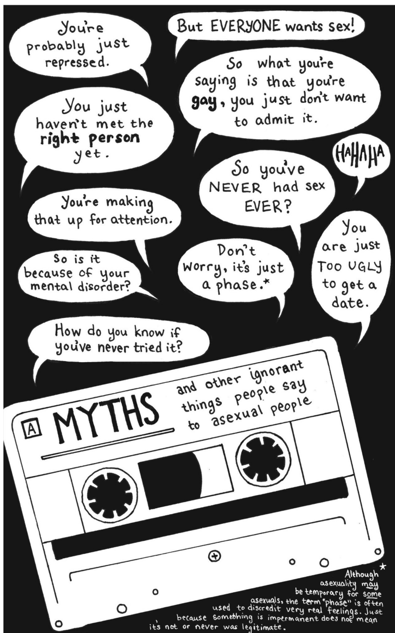
FIGURE 0.2. A selection of "denial narratives." From Taking the Cake: An Illustrated Primer on Asexuality zine by Maisha, 2012. 30