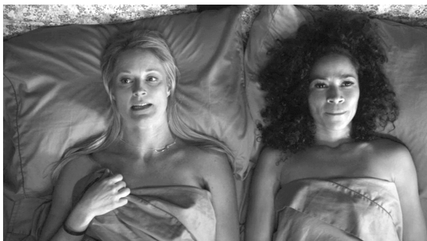
FIGURE 2.2. Still from season 2 of The Fosters . Stef (left) and Lena (right) undergoing “lesbian bed death.”

not exclusive role here in the sedimenting of the specialness of the couple as a unit of happiness. Stef and Lena, for instance in the first and second season, hover on the verge of dissolution and are haunted by lesbian bed death. In one of the early episodes of the first season, when their lesbian coupled friends are breaking apart, Lena and Stef reflect on their own relationship, focusing especially on their lack of time and drive for sex with each other. As seen in figure 2.1, they take time out of their busy lives to lie down together on their