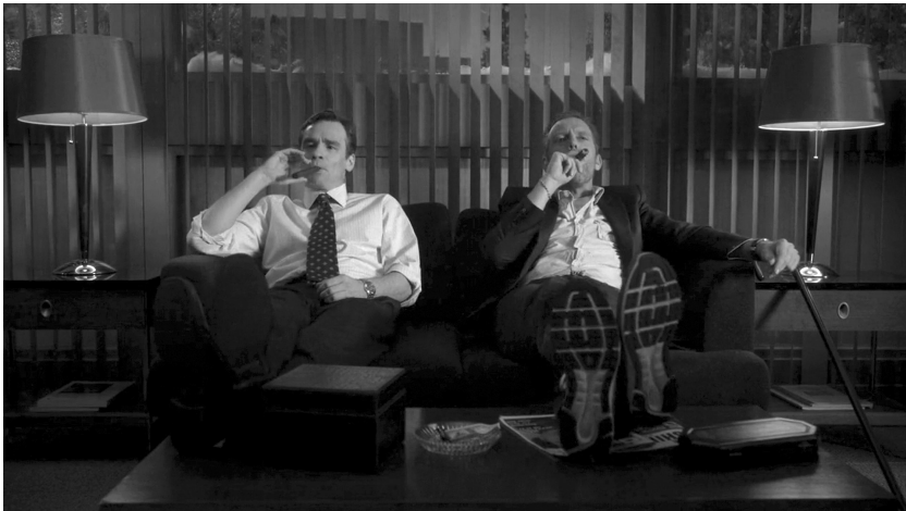
FIGURES 0.3A AND 0.3B. Asexuality on Fox Network's House ; the episode "Better Half" originally aired on January 23, 2012. The first image is of the couple learning that a brain tumor has led to asexuality in the man and that the woman is lying about asexuality. The second image is of the doctors reclining and sharing a cigar after their findings.

is entangled with whiteness, youth, normativity, able-bodiedness, coupling, and heterosexuality. It suggests that physiologically rooted asexuality is itself invalid as a sexual identity. Low levels of sexual desire are problematized by House as impossible and unfathomable without a medial cause, which, once found, opens the door to the practice of healthful coupled sex. House implies that it is indeed certain types of bodies that are encouraged to be sexual and desire sex and that to not be sexual or desire sex is inherently wrong and in need of fixing.