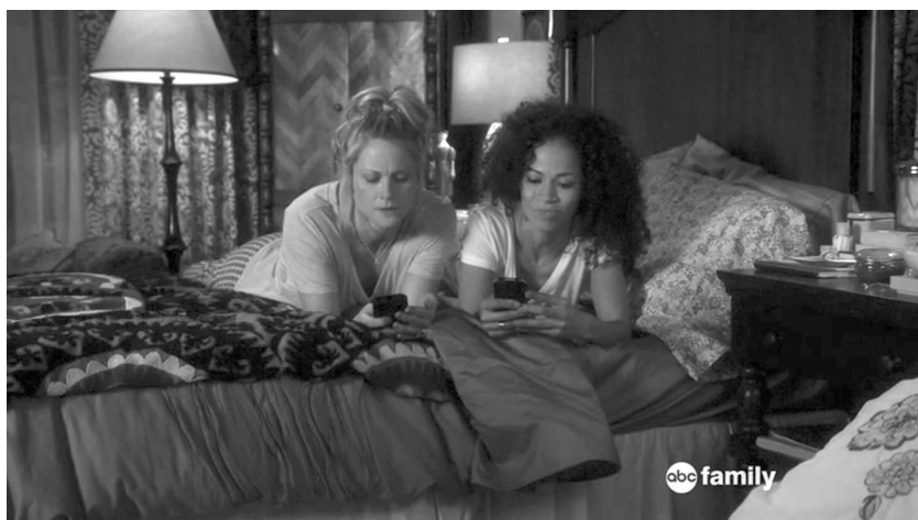
FIGURE 2.1. Still from season 1 of The Fosters . Stef (left) and Lena (right) plan a sex date on their smartphones.