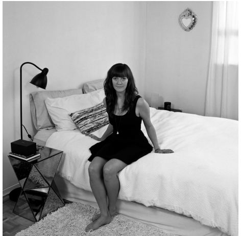
FIGURE 2.4. Kyle Lasky, Lesbian Bedrooms II , 2011.