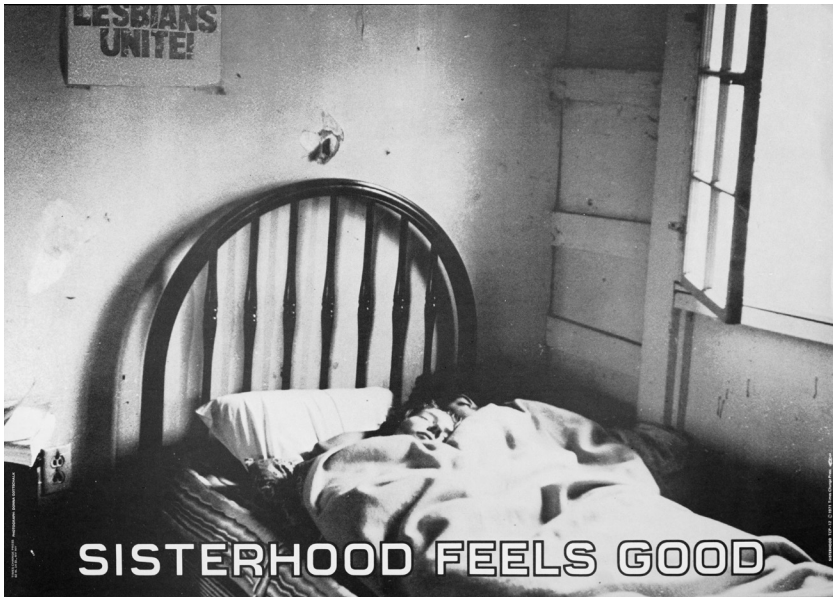
FIGURE 1.1. “SISTERHOOD FEELS GOOD,” printed as an offset lithograph by Times Change Press circa 1971, with photograph by Donna Gottschalk, 1969. Reprinted with the permission of Donna Gottschalk. Image provided by the Oakland Museum of California, with thanks to Brittany Bradley, Intellectual Property and Imaging Coordinator.

reducible to sexual energy but rather refers to the energies of collaboration, solidarity, and antiracist feminist organizing. In ways that echo this student’s statement, the erotic, drawing on Lorde, proved in the 1960s and 1970s to be a formidable resource that allowed organizers, activists, and writers to challenge injustice. Lorde argued that women are encouraged to separate the erotic from vital aspects of life and channel it solely into sex because when erotic energies are channeled away from sex and toward life making or revolution, women become “dangerous.” 5 In turn, through “recognizing the power of the erotic” feminists “pursue[d] genuine change within [their] world[s] . . . in the face of a racist, patriarchal, and anti-erotic society.” 6 This utilization of the erotic was grounded in collective struggle against injustice, “deep participation” as Lorde calls it, which made the fight against injustice possible in the first place. 7 Drawing on this ideation of erotics as not only bound to sexual desire but rooted in an intimate challenging of sexism, racism, classism, and homophobia opens up space for political celibacies/asexualities to be formulated as erotic rather than as against erotics, as they have often been framed under monikers of “sex negativity.” This chapter considers erotics in seeking